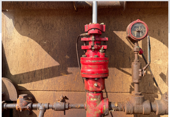
Stuffing box appearance after introduction of automatic lubrication