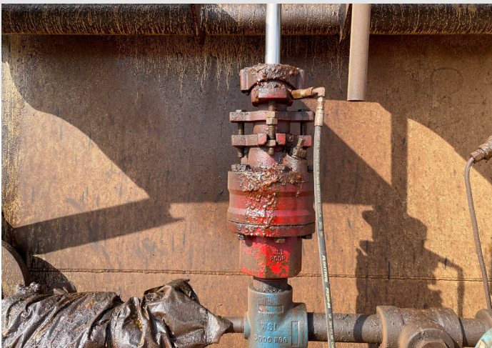
Stuffing box appearance after conventional application of lubricant

Comply with Environmental, Safety and Health (ESH) standards with a solution that keeps the ground clear and maintenance away from the stuffing box assembly.