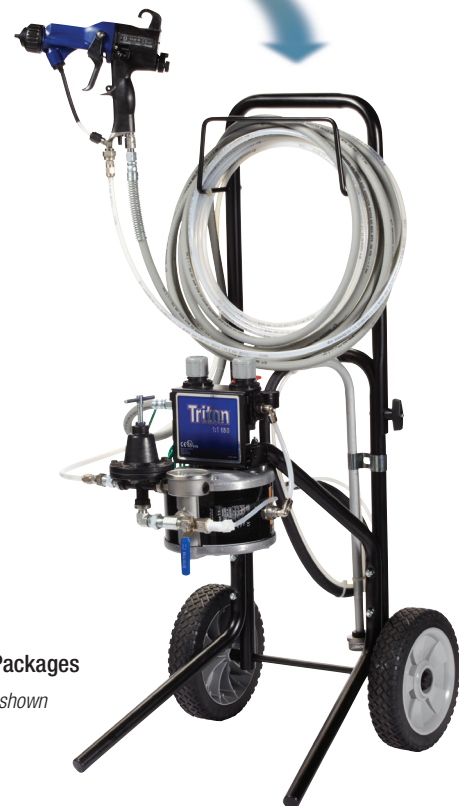
Pro Xp Electrostatic Spray Gun Packages

Model No. 233747 with Pro Xp60 gun shown