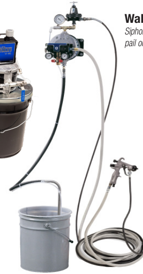
Wall Mount Siphon tube and pail ordered separately.