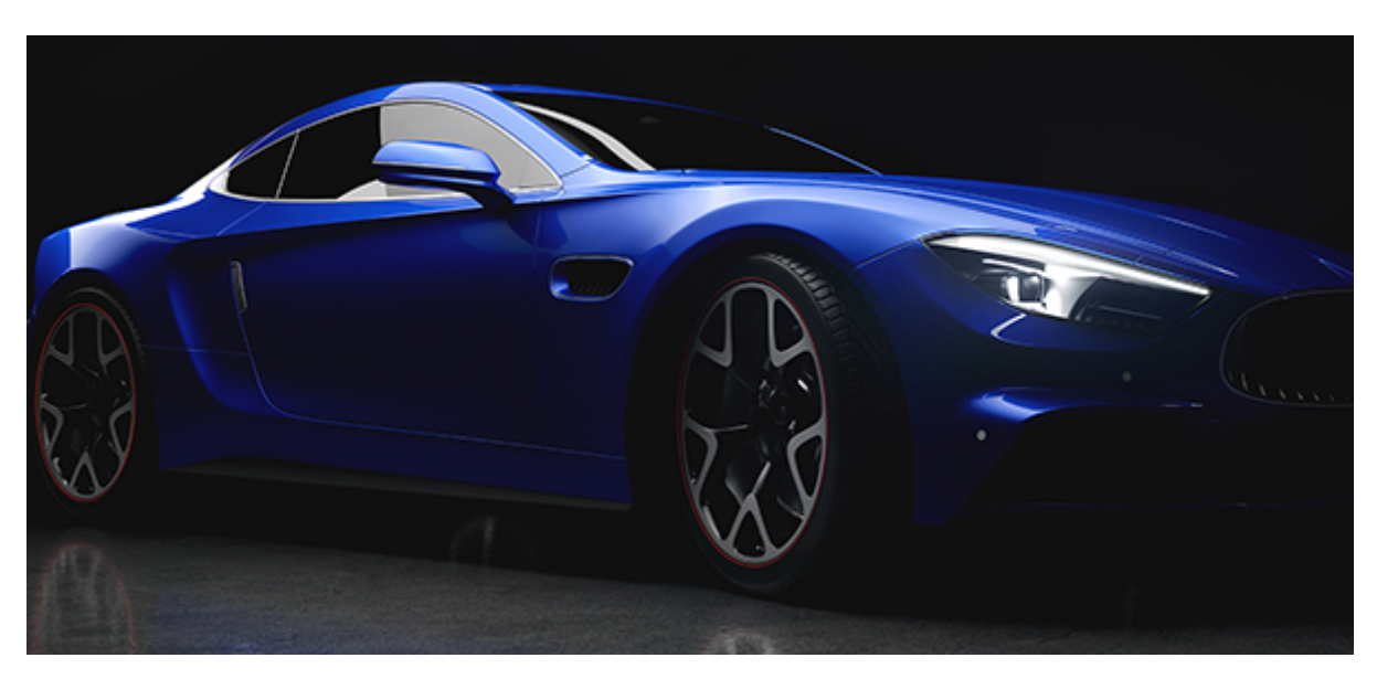
Why paint degradation is a problem for automotive manufacturing?

Take full control of your paint mix room