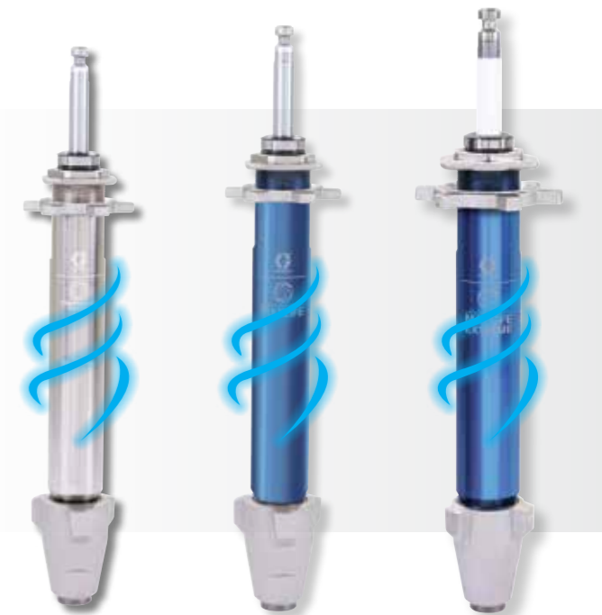
Endurance Chromex™ Pump Lasts 2X longer than competing pumps