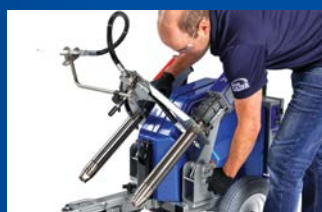
2) Tilt pump assembly back