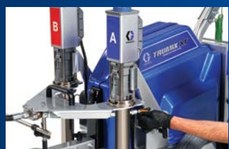
1) Remove retaining clamps and pressure transducer connections