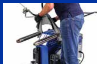
3) Remove ProConnect Pumping System