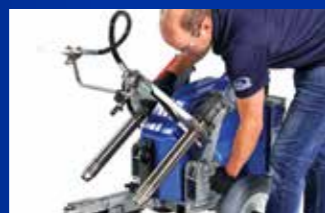
2) Tilt pump assembly back