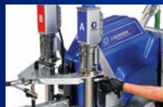
1) Remove retaining clamps and pressure transducer connections