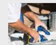
2) Remove the old pump from the sprayer