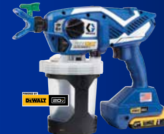
ULTRAMAX CORDLESS AIRLESS HANDHELD

SPRAYS WATER AND MINERAL SPIRITS-BASED MATERIALS ONLY (NO FLAMMABLE MATERIALS)