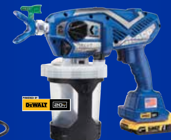
ULTRA CORDLESS AIRLESS HANDHELD