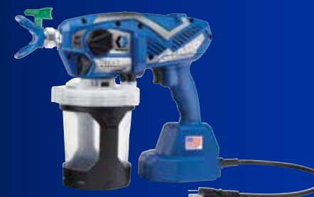
ULTRA CORDED AIRLESS HANDHELD