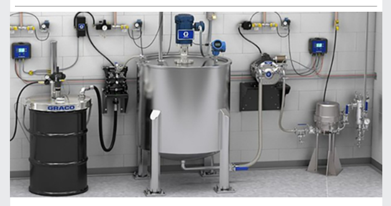
Intelligent Paint Kitchen Delivers Cost Effective Pump Control

An automaker noticed that certain colors or metallics were going flat and had to be thrown out. Graco liquid finishing experts found out why. White paper author explains <u>how to get</u> that "new car" finish without wasting paint.