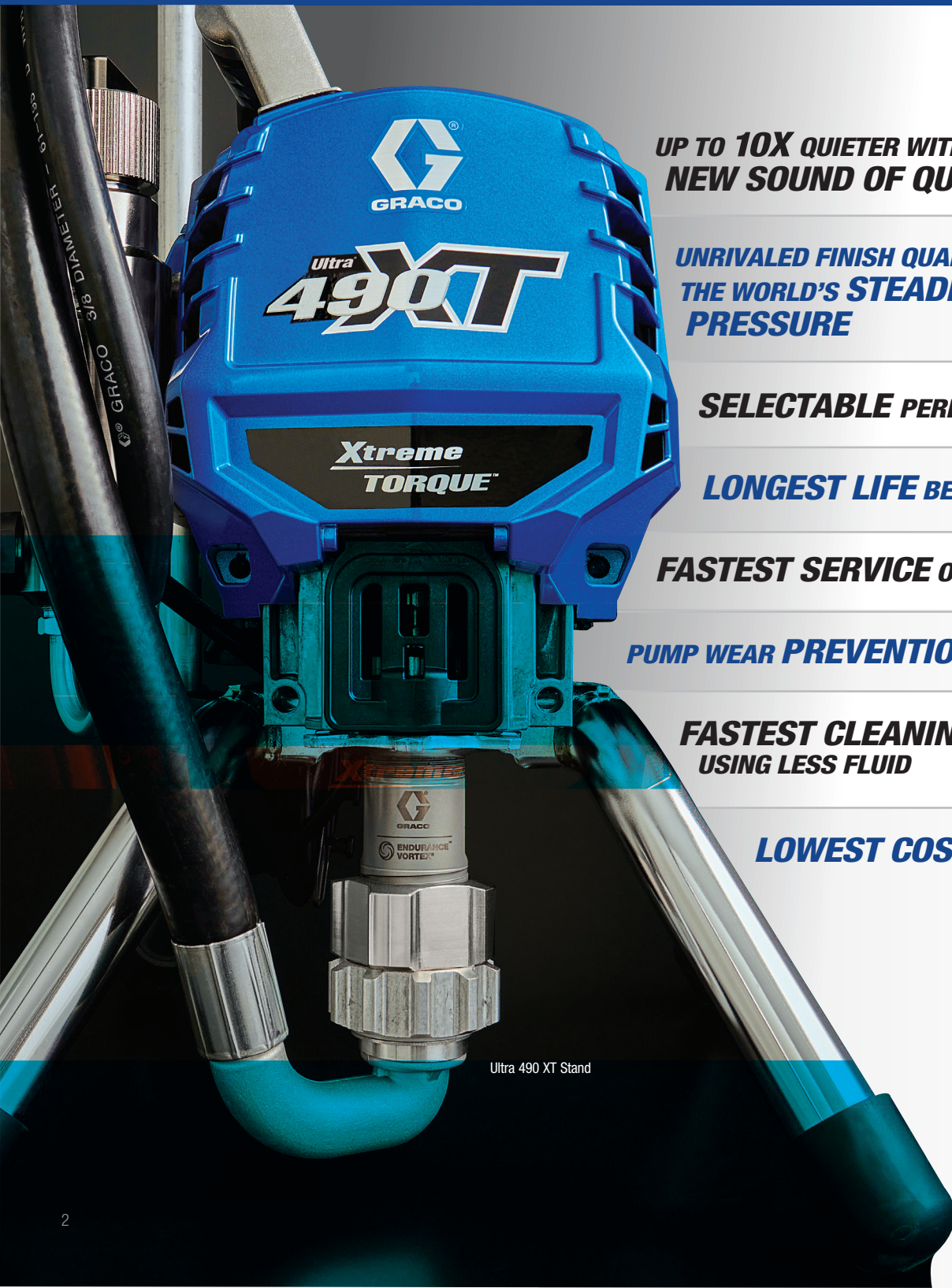
Ultra 490 XT Stand

UP TO 10X QUIETER WITH THE NEW SOUND OF QUALITY™