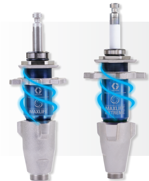
Endurance Vortex MaxLife Pump 6X longer between repacks