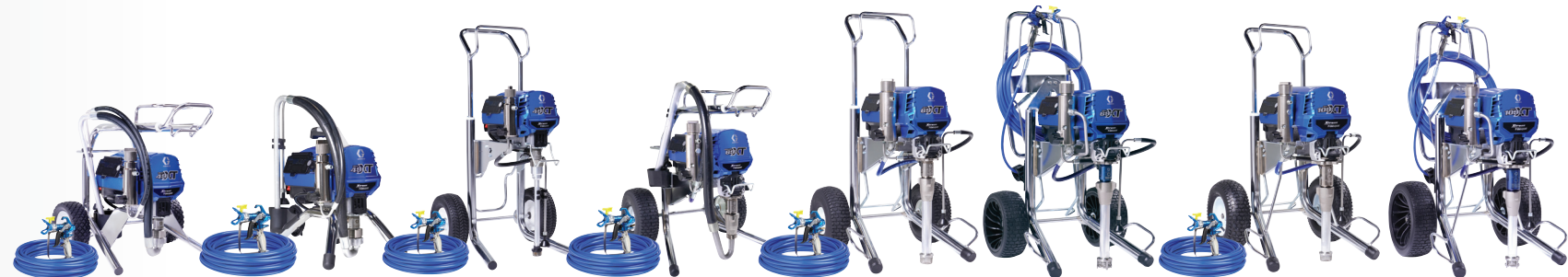
BREAKTHROUGH FEATURES ACROSS THE ENTIRE XT LINEUP

Intelligent auto-shutoff feature activates when the sprayer runs out of paint, safeguarding the pump and maintaining consistent performance.