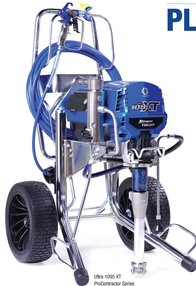
Ultra 1095 XT ProContractor Series