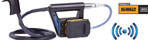
Contractor PowerShot XT