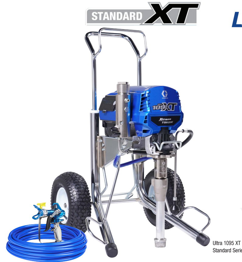
Ultra 1095 XT Standard Series