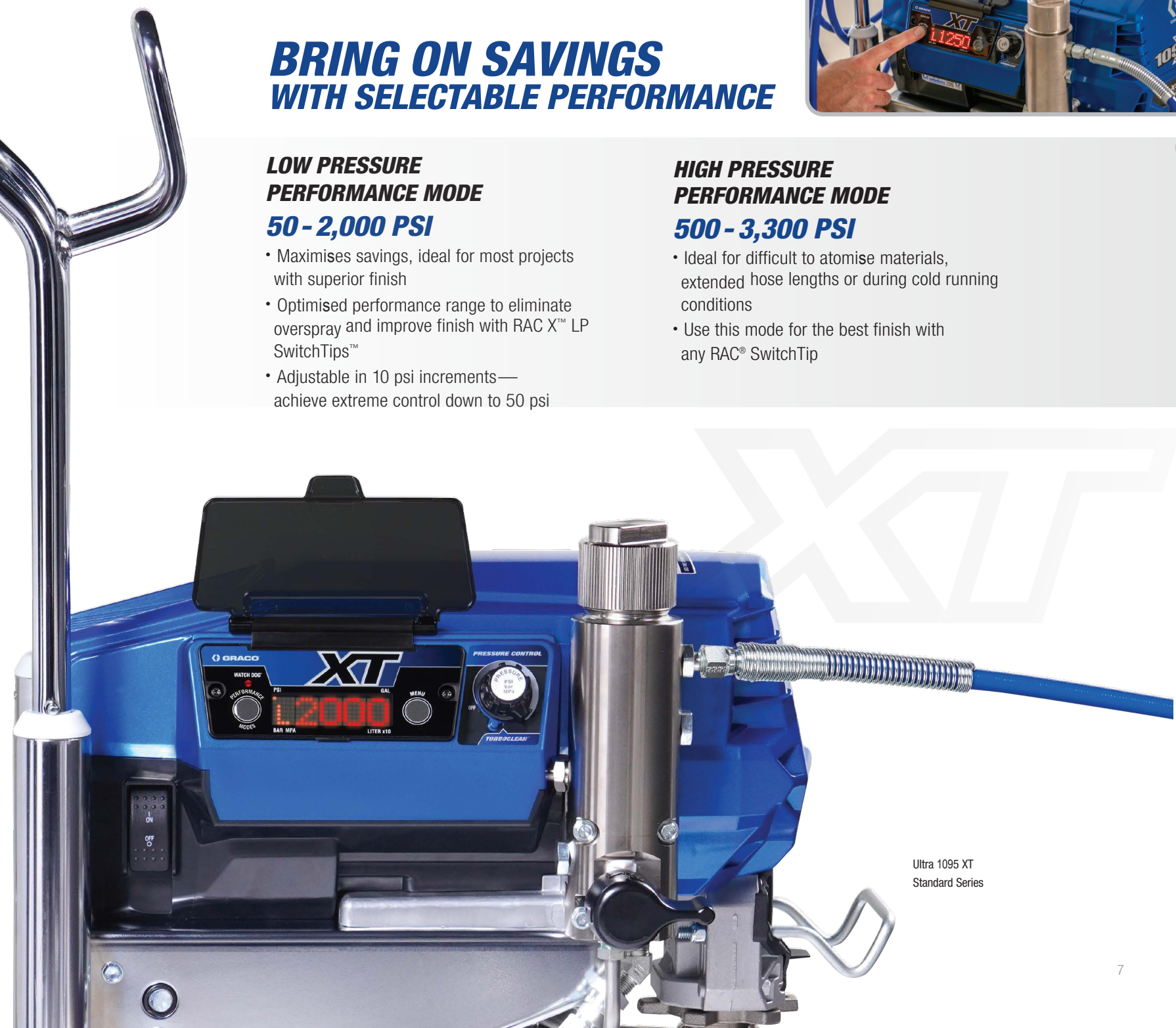
Ultra 1095 XT Standard Series