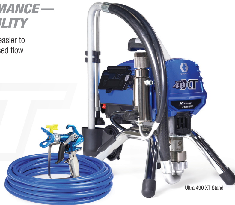
Ultra 490 XT Stand

Midsized electric airless sprayers make it easier to get more work done in a day with increased flow and production rates.