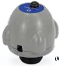
25T460 Ultrasonic Wi-Fi

Gain Insight Into and Control of Your Bulk Fluids