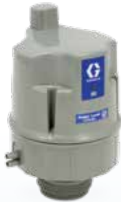
25T461 Ultrasonic Cellular