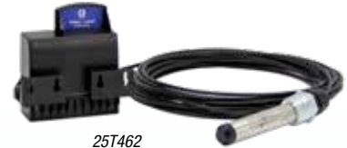
25T462 Pressure Cellular