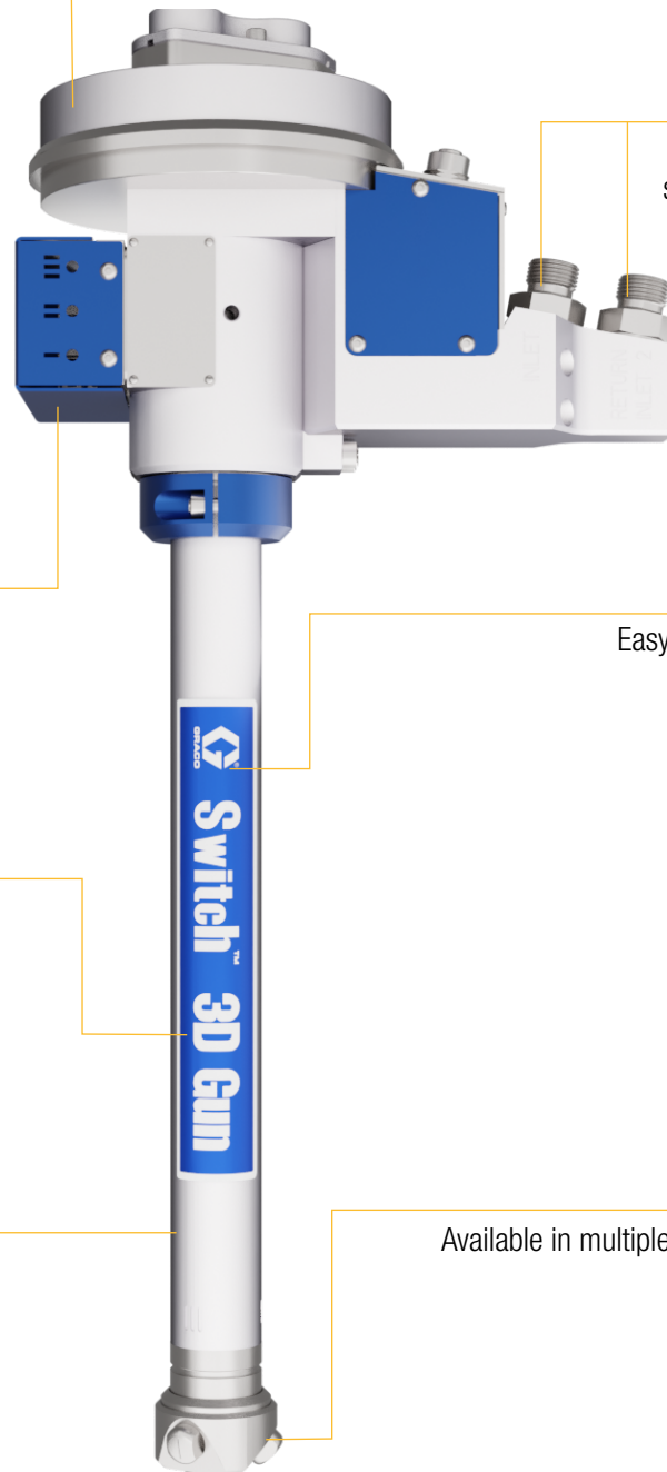
Pictured: Switch 3D Gun for Seam Sealing Applications

Available in multiple angles and slot directions