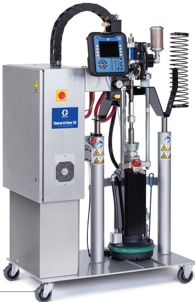
Therm-O-Flow 20 (5 gal)