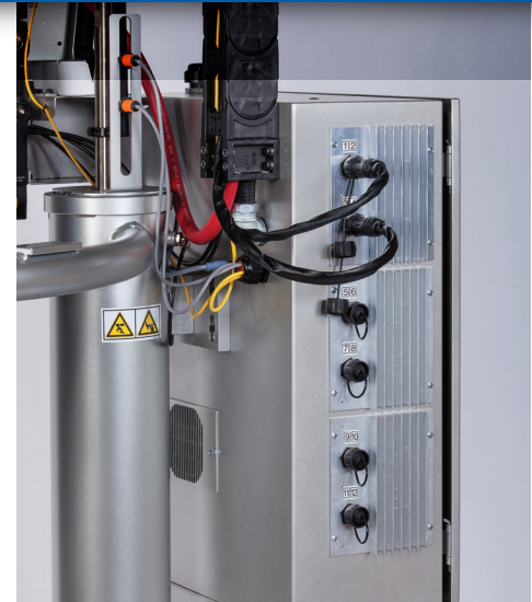
Six connection points for the 12 customer defined heat zones

Graco offers a complete line of Therm-O-Flow bulk hot melt systems and "point of use" melt systems – each can be configured to fit your specific application.